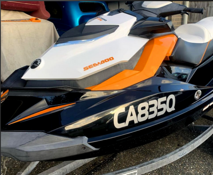
Product: Malco EPIC Compounds & Banana Creme Wax Detailer's socials: @arj_marine_detailing ARJ marine services & detailing