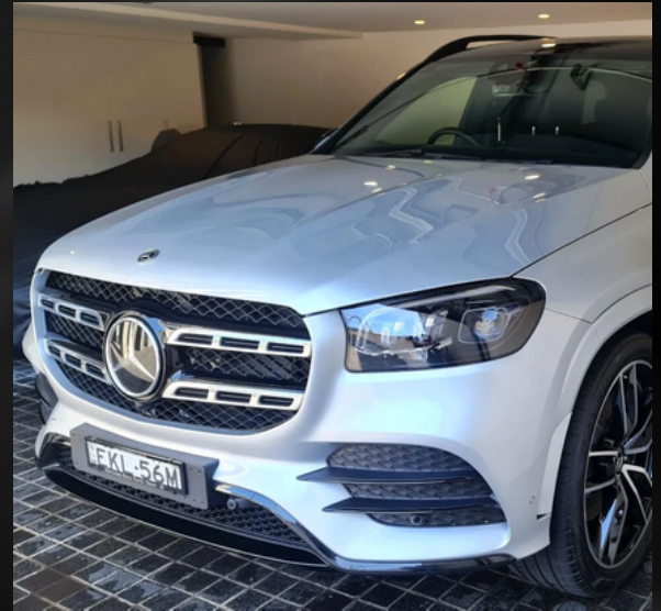
Product: EPIC Heavy & Medium Duty Compound Detailer's socials: @blackwhitedetailing