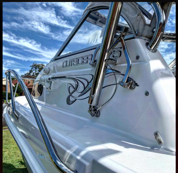
Product: Presta Marine Product range Detailer's socials: @kleanmarineservices